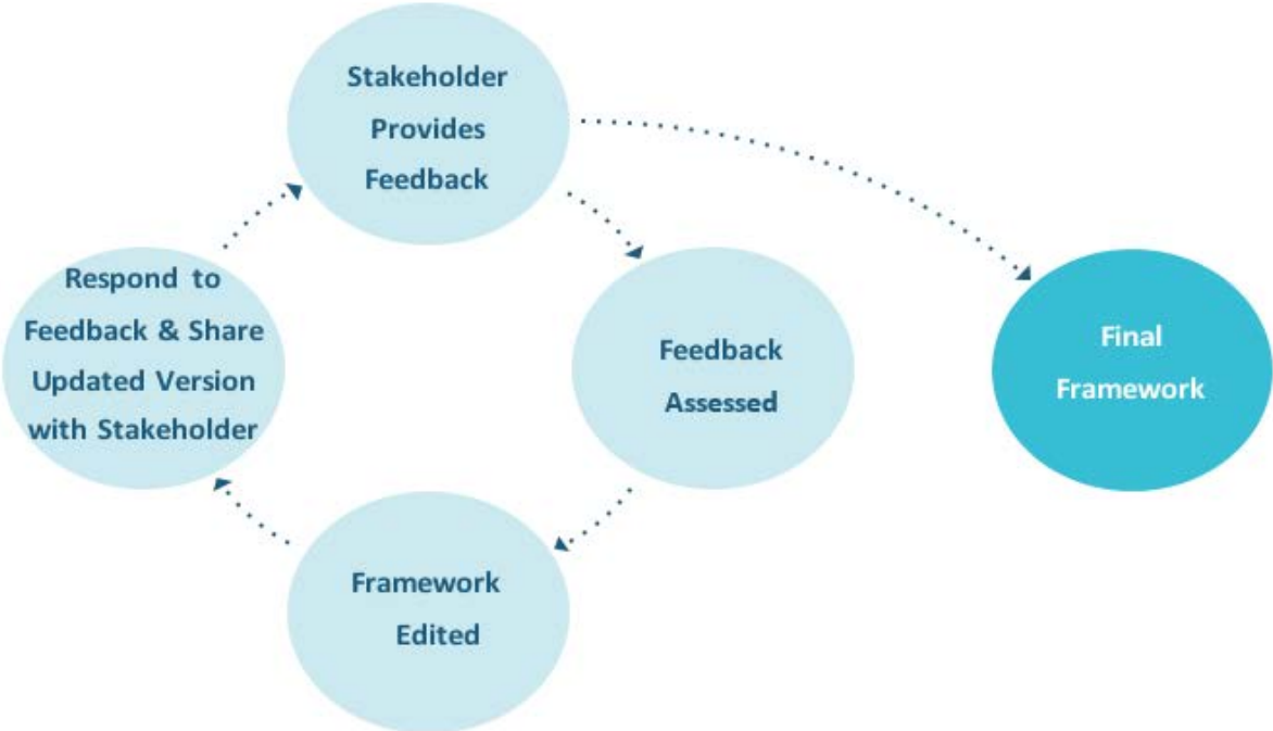
Figure 3. Review Process