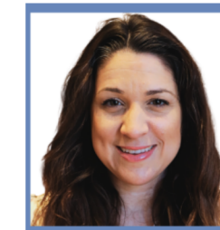
Palliative Care Nurses Interest Group (PCNIG) Graduate Scholarship