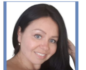
Palliative Care Nurses Interest Group (PCNIG) Baccalaureate Scholarship