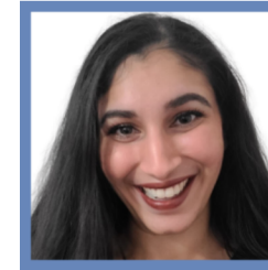
Palliative Care Nurses Interest Group (PCNIG) Baccalaureate Scholarship [McMaster University]