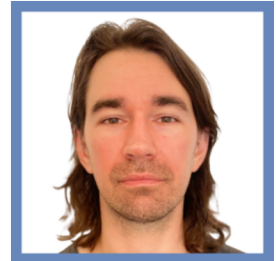
Palliative Care Nurses Interest Group (PCNIG) Baccalaureate Scholarship [McMaster University]

He previously worked as a community and political organizer in low-income neighbourhoods for eight years, and hopes to bring his passion for social justice and serving marginalized populations to his future nursing practice. He was inspired to return to school at the ripe age of 38 by his partner, a midwifery student, and the birth of his son, now a 10 month old baby.